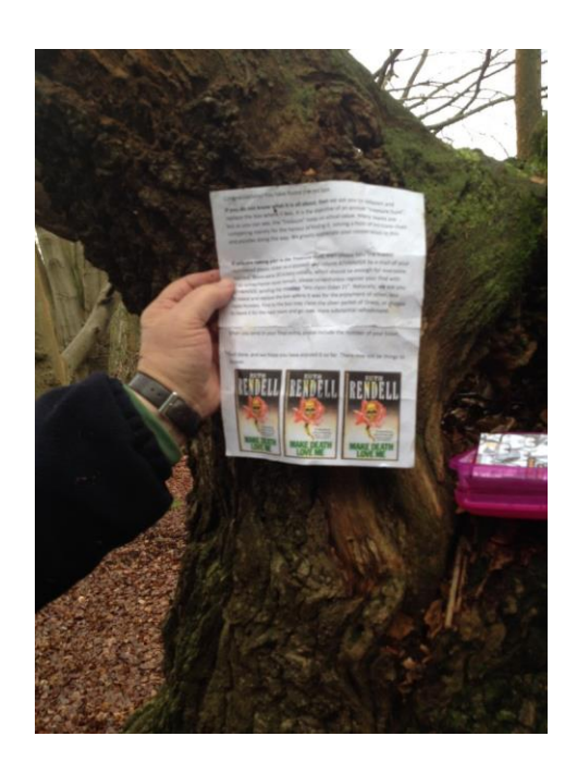
Rod finding the box and the contents – no tickets left!