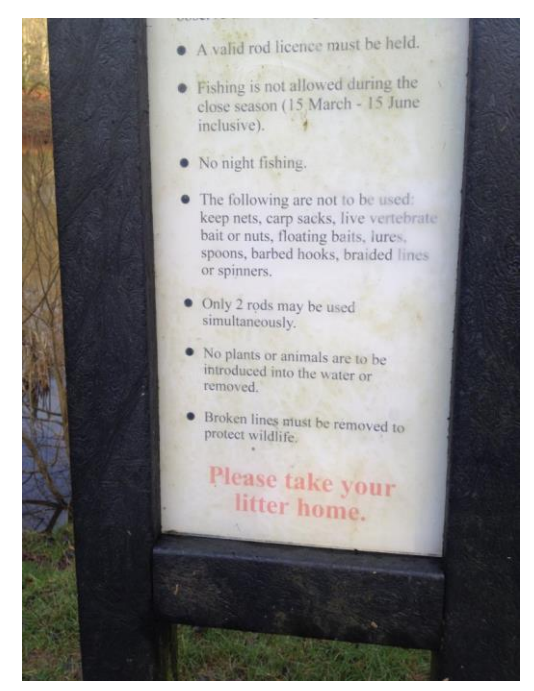
Mud and "no nuts or spoons"

We then proceeded up WNW (our Garmin GPSs confirming the accuracy of the heading) for 100 rods or so (approx 500m) until we arrived at the clearing with post.