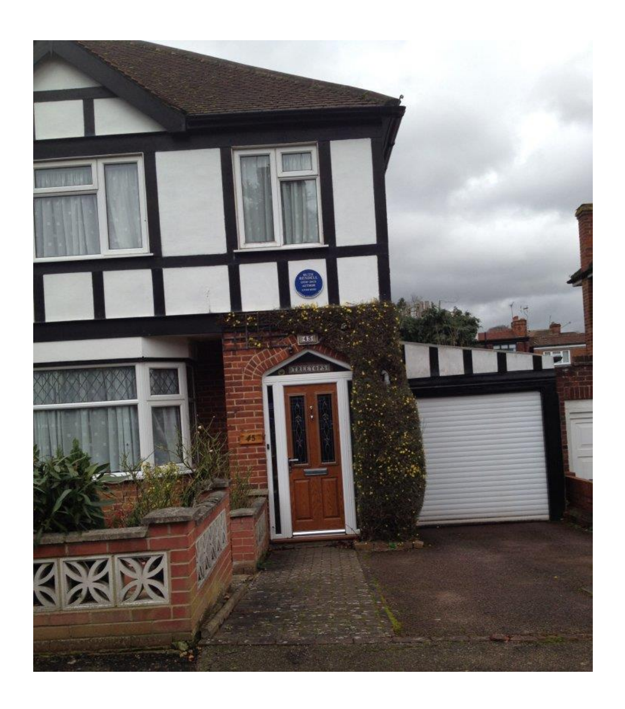
The theme of the hunt: Ruth Rendell's house complete with blue plaque.