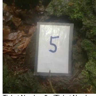
Ticket Number 5. (Ticket Number 4 was retrieved by Steve Hames' team around an hour earlier.)