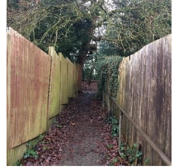
Take signed footpath west. Follow path to right, by fence. Cross road.