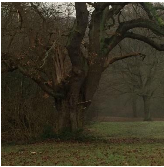
Head down to left. Note runged tree and bench to right.