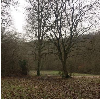
After a boggy furlong...