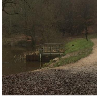
Take main path up WNW a hundred rods [about 500m]...