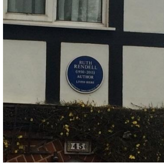
Start at my Blue Plaque (Ruth Rendell's old house on 45 Millsmead Way, Loughton)