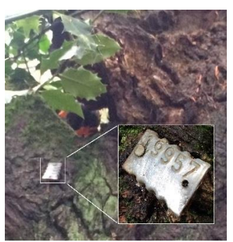
...inside tree CXCIXLVII [tree numbered as 19957. Note the holly as clued in introduction.]