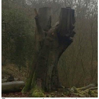
From truncated tree go anticlockwise round the [Lost /Blackweir] pond for 30 yards