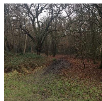
Sharp right into wood continue to