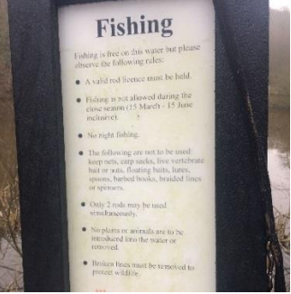
...notice no nuts or spoons [fishing rules at Baldwin's pond]