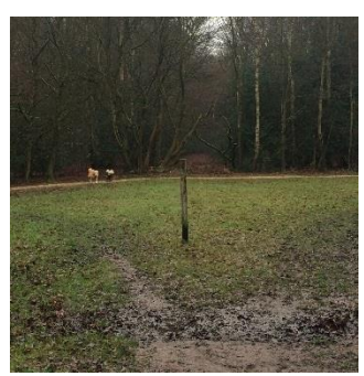
... to clearing with a post.