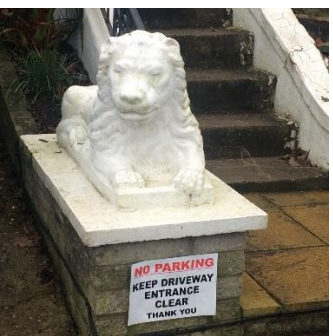
Head North [past this Lion on Sedley Rise – on a different Lion's Mane adventure]